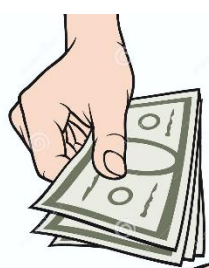
Application Fee of Php 7,000.00