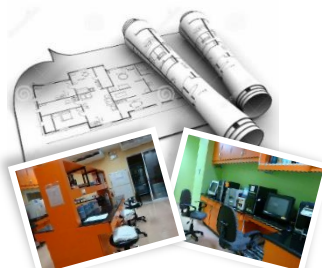
Floor Plan (photocopy) and Photos of the Bacteriology Laboratory