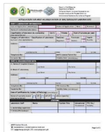
Fully accomplished ARSP Accreditation Application Form